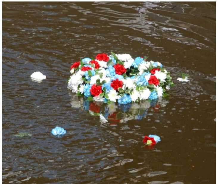
A wreath honors the lost