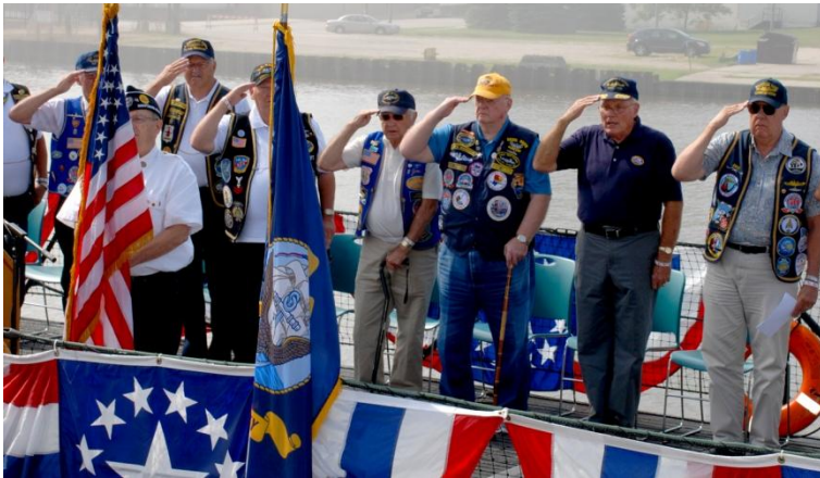
Tolling of the Boats ceremony aboard USS Cobia (SS-245)

the life of the Lagarto, primarily through letters written between crewmembers and their families. It also describes the effort, once the ship's final resting place was found, to locate and contact descendants and other family members and friends of the crew.