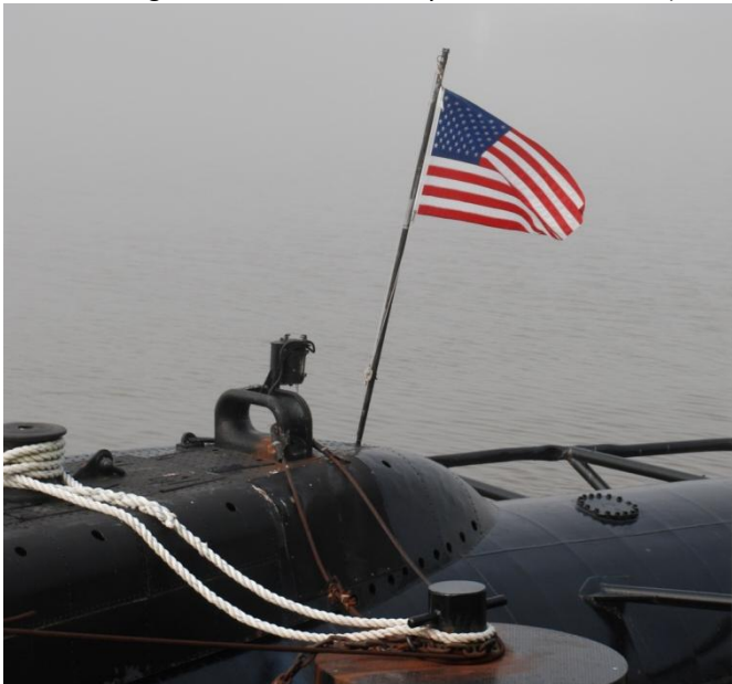
USS Cobia files the colors