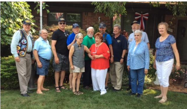
The group poses for the camera