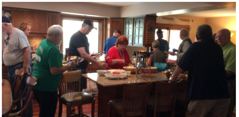
Plenty to eat