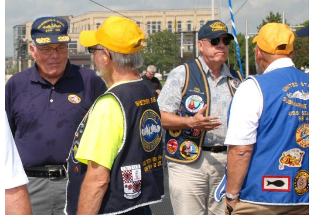
Subvets at the ceremony