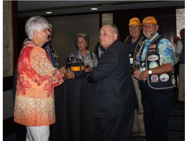
Wolverine Base members at the Awards Dinner